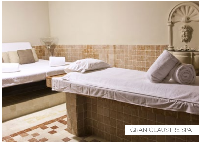
GRAN CLAUSTRE SPA