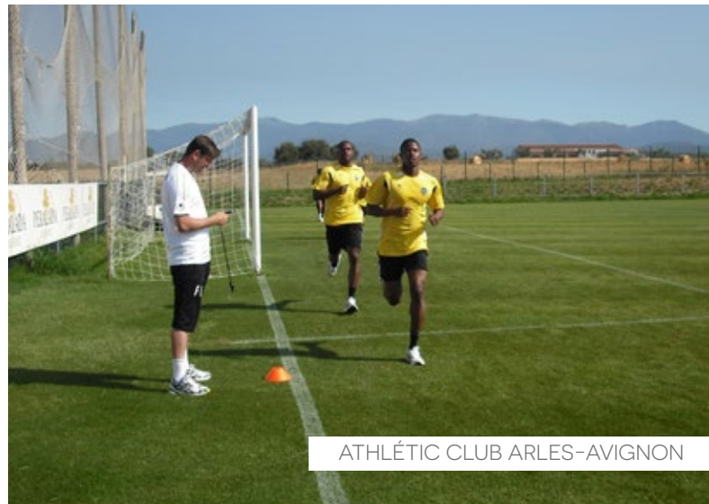
ATHLÉTIC CLUB ARLES-AVIGNON