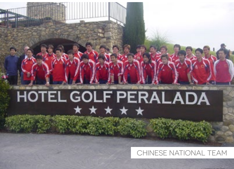
CHINESE NATIONAL TEAM