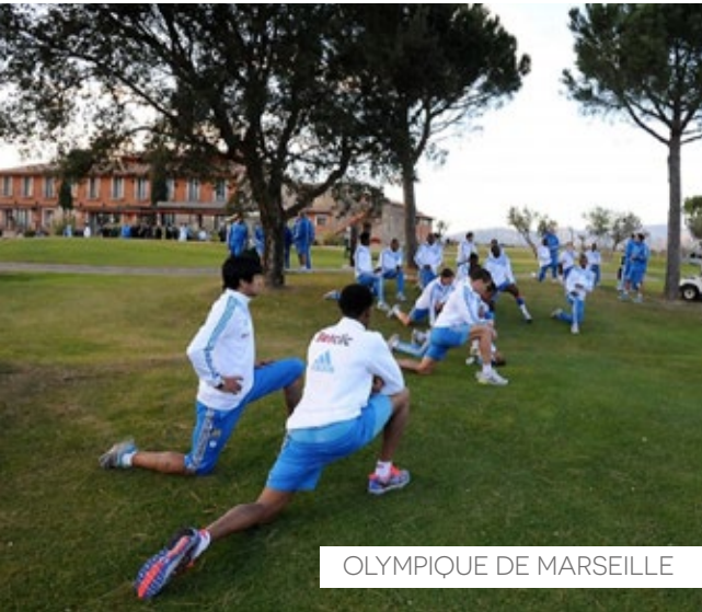
OLYMPIQUE DE MARSEILLE