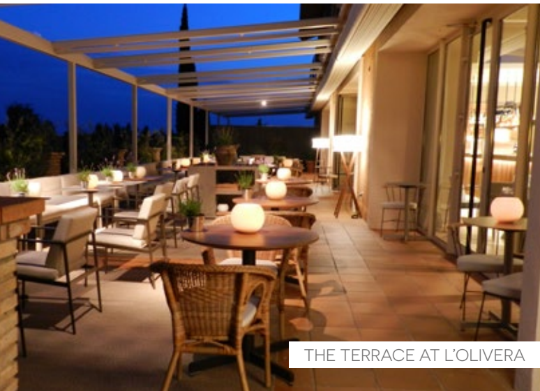
THE TERRACE AT L'OLIVERA