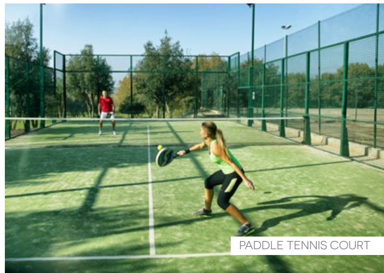
PADDLE TENNIS COURT