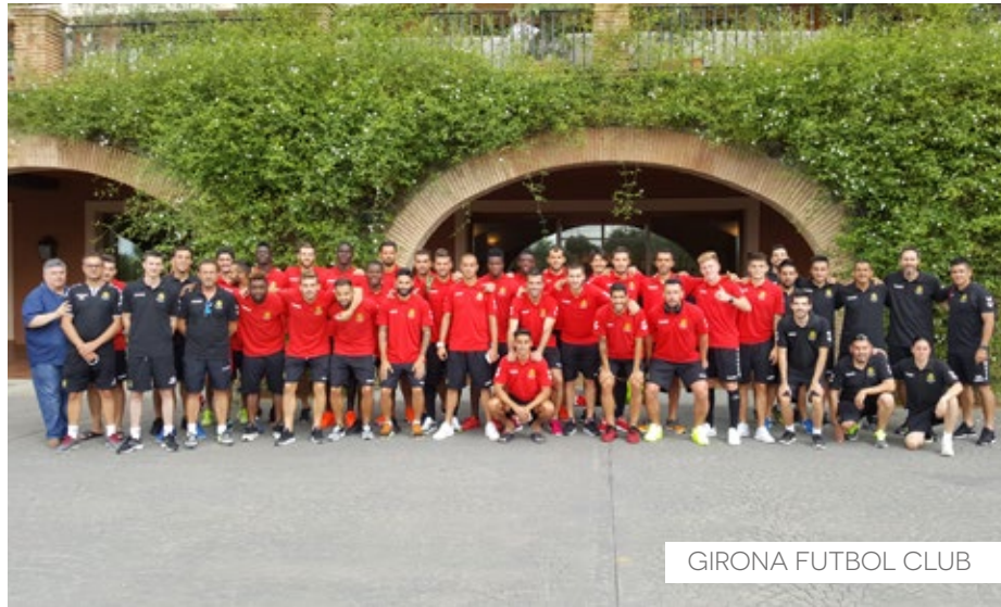
GIRONA FUTBOL CLUB