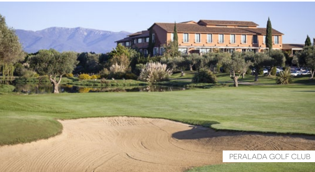
PERALADA GOLF CLUB